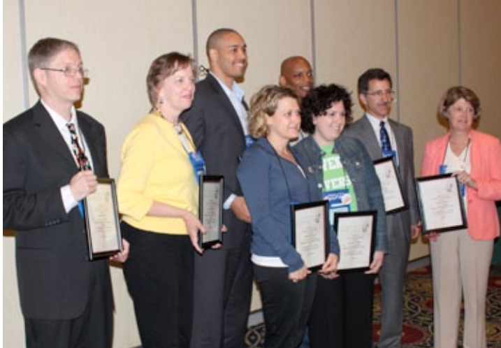
The 2010 Counselor of the Year Award recipients during the Spring Conference.

Potomac and Chesapeake ACAC presents ten Counselor of the Year Awards during our annual spring conference. The award honors one school counselor and one college counselor from each state within our region, as well as the District of Columbia. The award recognizes the hard work and dedication that goes into our profession and sense of accomplishment for a job well done. Congratulations to the following PCACAC Counselor of the Year 2010 recipients: