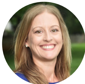
ALICE ROBERTSON PROFESSIONAL DEVELOPMENT CHAIR

Director of Freshman Recruitment Radford University (VA)